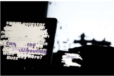
Buzz Aldrin Doesn't Know Any Better, touchscreen with Buzz iPad and iPhone app. Touchscreen interactives. (2008 - 2011)