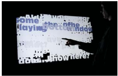
Buzz Aldrin Doesn't Know Any Better, touchscreen middle panel of Things You've Said Before But We Never Heard triptych (detail). Touchscreen interactive. (2008 - 2011)